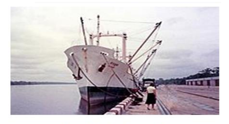
Figure 2: Calabar River Port 1n 1981

Calabar today has regained its importance as port with the completion of roads providing good access to South-Eastern Nigeria and Western Cameroon.Exports include palm produce, timber, rubber, cocoa, copra, and cassava fibre. Industries include sawmills, a cement factory, boat builders and plants to process rubber, palm oil and food. Artisans make ebony artifacts for the Lagos tourist market (see Figures 2 and 3). The development of the port, and the neighboring Calabar Free Trade Zone and Tinapa Free Zone & Resort have been held back in recent years by bureaucratic problems, and also by poor power supply, poor roads and lack of dredging of the shallow Calabar River channel (Nigerian Pilot, 2010).